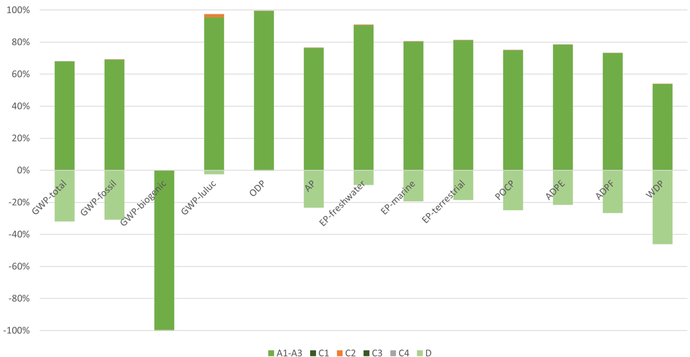
Hot-spot analysis of mesh ceiling tiles & panels (1,5 mm)

The comparison of the products' life cycle phases shows a clear dominance of the production phase (modules A1-A3).