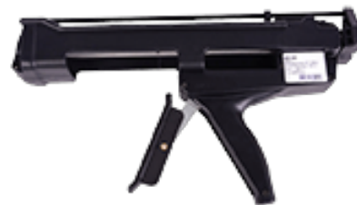
Cartridge applicator gun WIT Designed for Special Adhesive WIT-VM-250