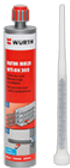
Special Adhesive WIT Special Adhesive for concrete and masonry