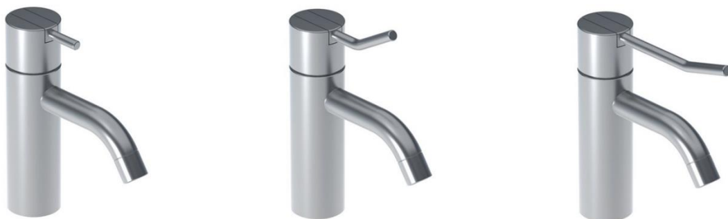
Figure 3: HV1+30, HV1M+30, and HV1L+30