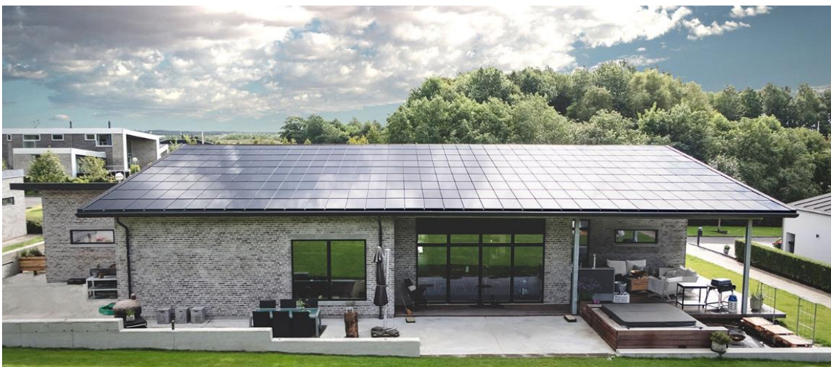
Example of BIPV roof by Ennogie at HC Lumbyesvej, Ikast, built in the year 2018