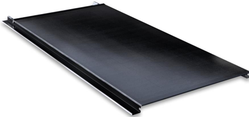
The BIPV module ERS-0191 (130W) produced by Ennogie ApS